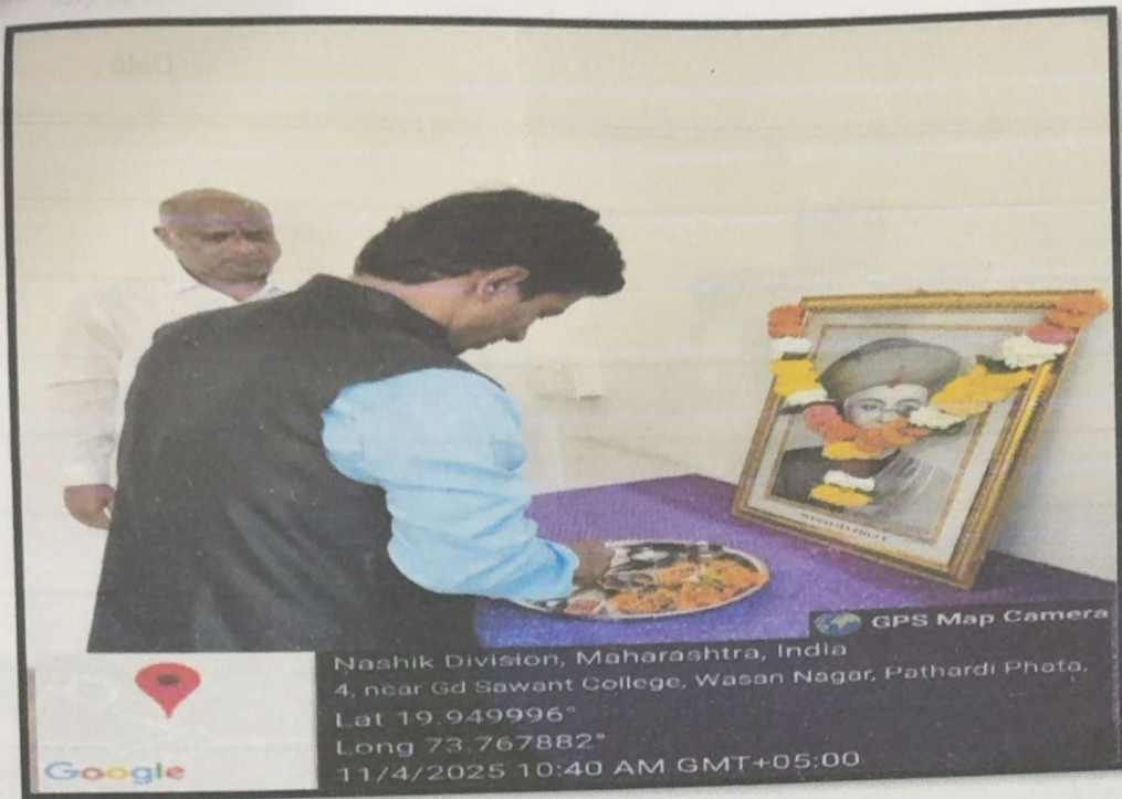
Tribute to Jyotiba Phule portrait