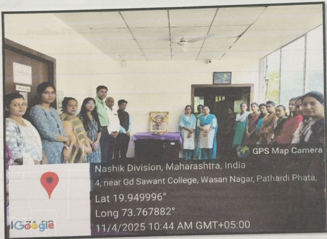
Jyotiba Phule Birth Anniversary Celebrated by Faculty Members