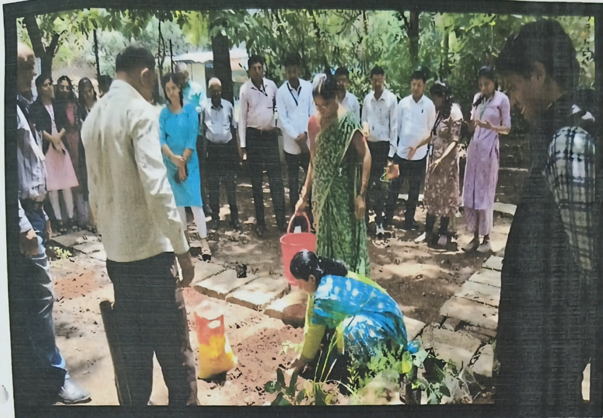
Tree plantation by faculty