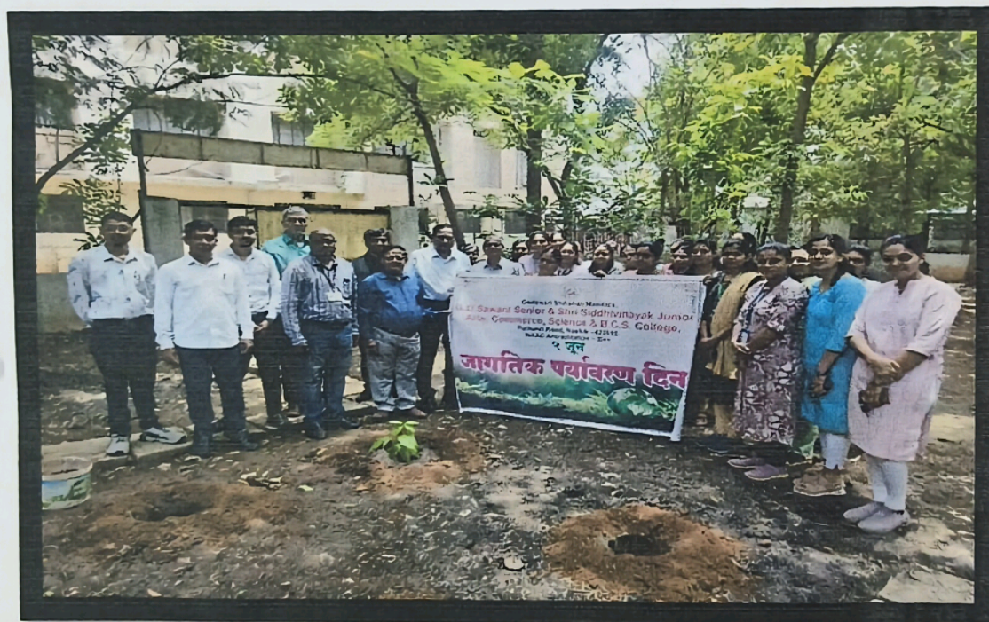
Celebrating world Environmental day with faculty member and students